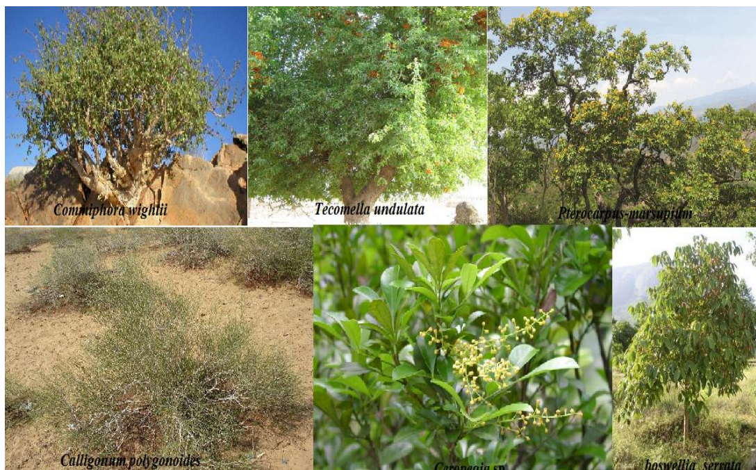
Some Endangered Plant Species of Rajasthan